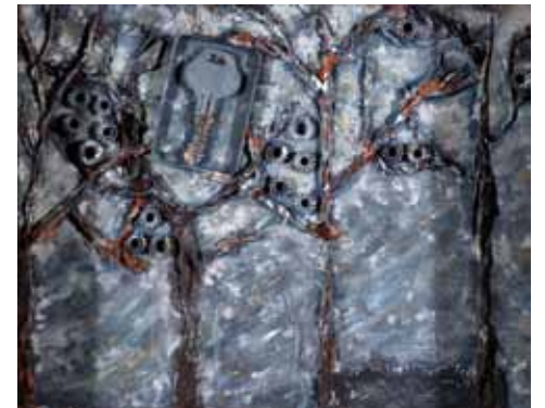
Jodi Gordon "A Winter's Tale"