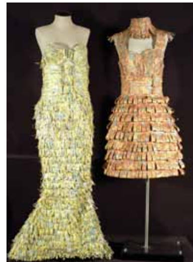
Shea Stiebler "Directional Dresses"