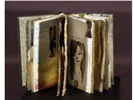
Danielle Boddy "Doorway To The Underground"