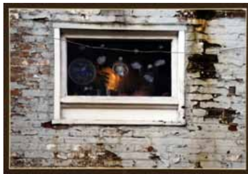
Lauren Cullen "Window Dreaming"