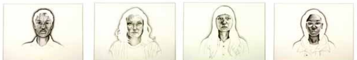
Morgan Strahorn "Self Interlochen" (Series of 4)