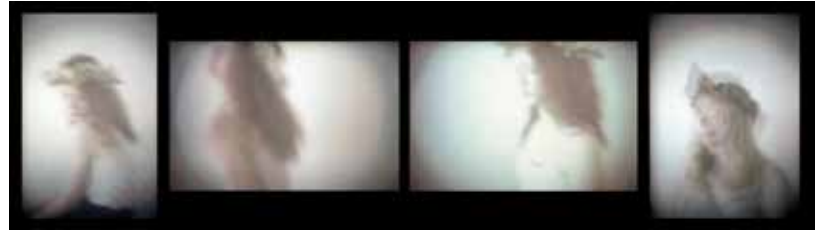
Coco Gagnet "Hallowed" (Series of 4)