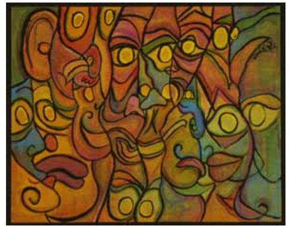
Jared Cox "Grebo People"