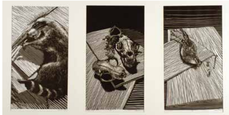
Josh Cigrang "Untitled" (Series of 3)