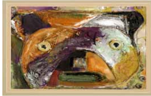
Abou Diomande "Mask"