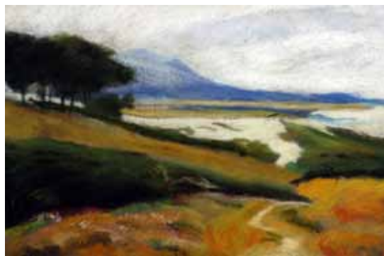
Jody Odom "Melancholy Morning"