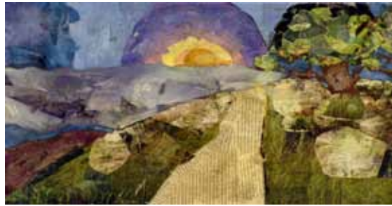
Kara Barger "Mountainside Sunset"