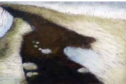
Brianna Crouse "Crooked River"