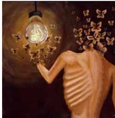
Darienne Potter "Finding Light Through Dark"