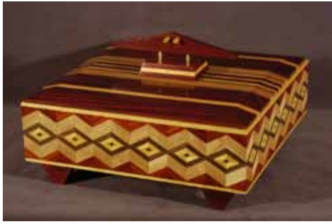
Chase Franklin "Diamond Box"