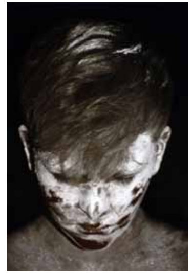
Elliot Nick "Untitled"