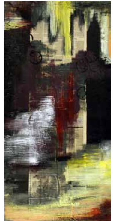
Haley Fowler "Washin' Away the Stain"