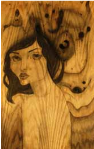
Mariah Plagemann "Fading Away Slowly"