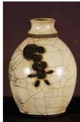
Abbey Sylvester "Deux Bandes Noires"