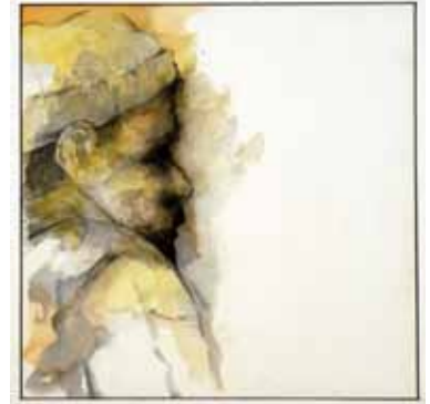
Samuel Neer "Contemplation #2"