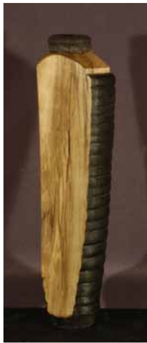
Tommy Bennett "Vase 1"