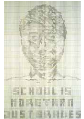
Tuscan Duckro "Standardized Creativity"