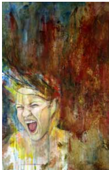
Casey Herndon "No Forewarning"